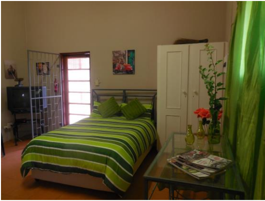
Rose & Stallion 1